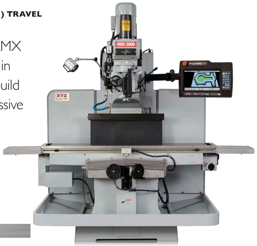
Guards removed for clarity

The XYZ RMX 5000 gives you an advantage! How many companies do you know with 1,500mm X axis capacity on a relatively low cost CNC Bed Mill?