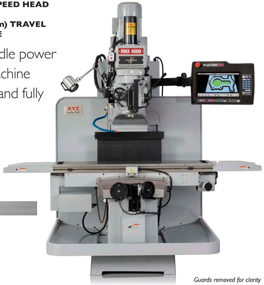
Guards removed for clarity

The XYZ RMX 4000 has a 1,000mm 'X' travel machine offers massive capacity at a very competitive price.