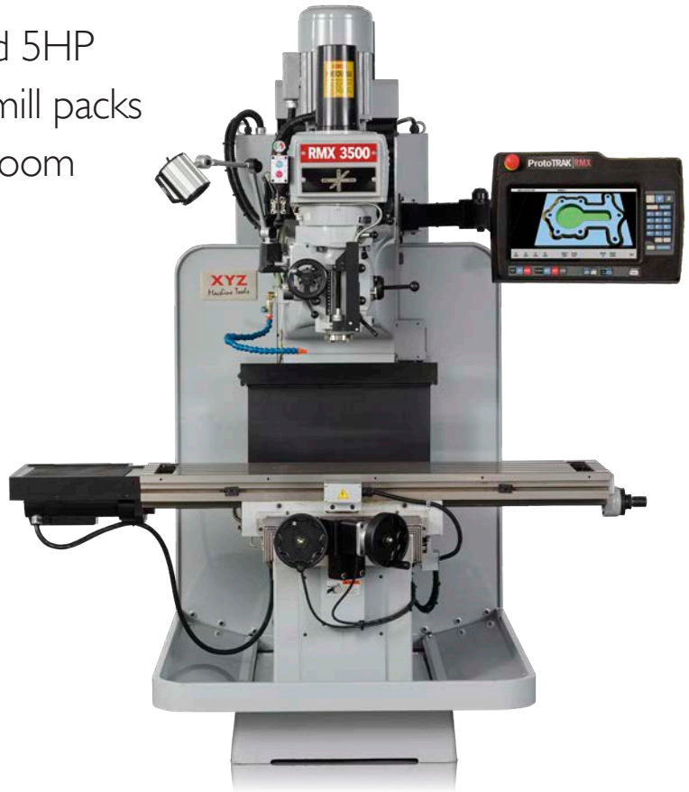
Guards removed for clarity