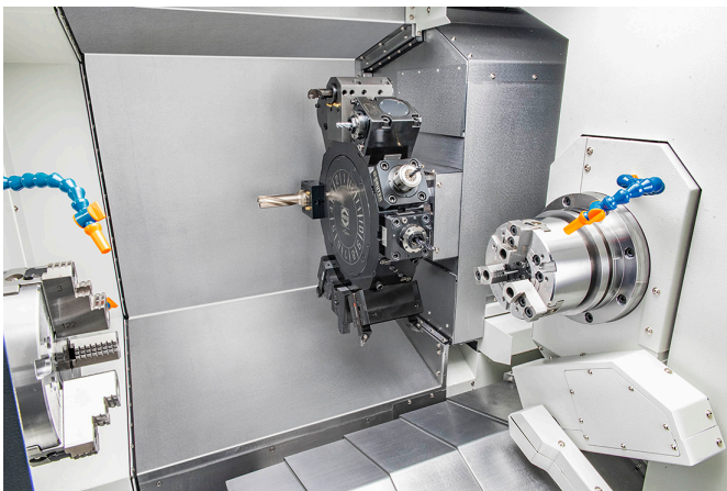
Main and Sub Spindle with Sauter BMT 65 Turret.