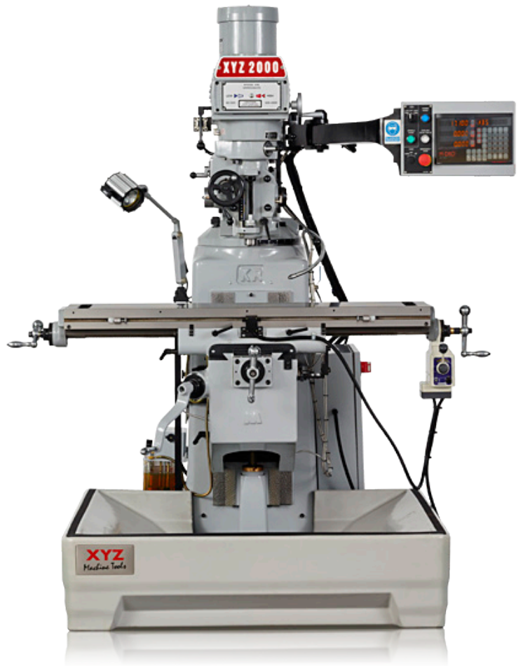
Guards removed for clarity

All XYZ manual machines are built of solid ribbed cast iron to provide unrivalled rigidity and stability and all are fitted with European bearings and electrical components to full CE approval.