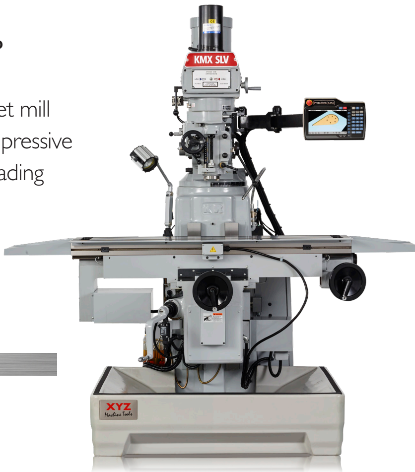
Guards removed for clarity

The XYZ KMX SLV has 1,000 mm of 'X' travel making this one of the largest turret mills on the market.