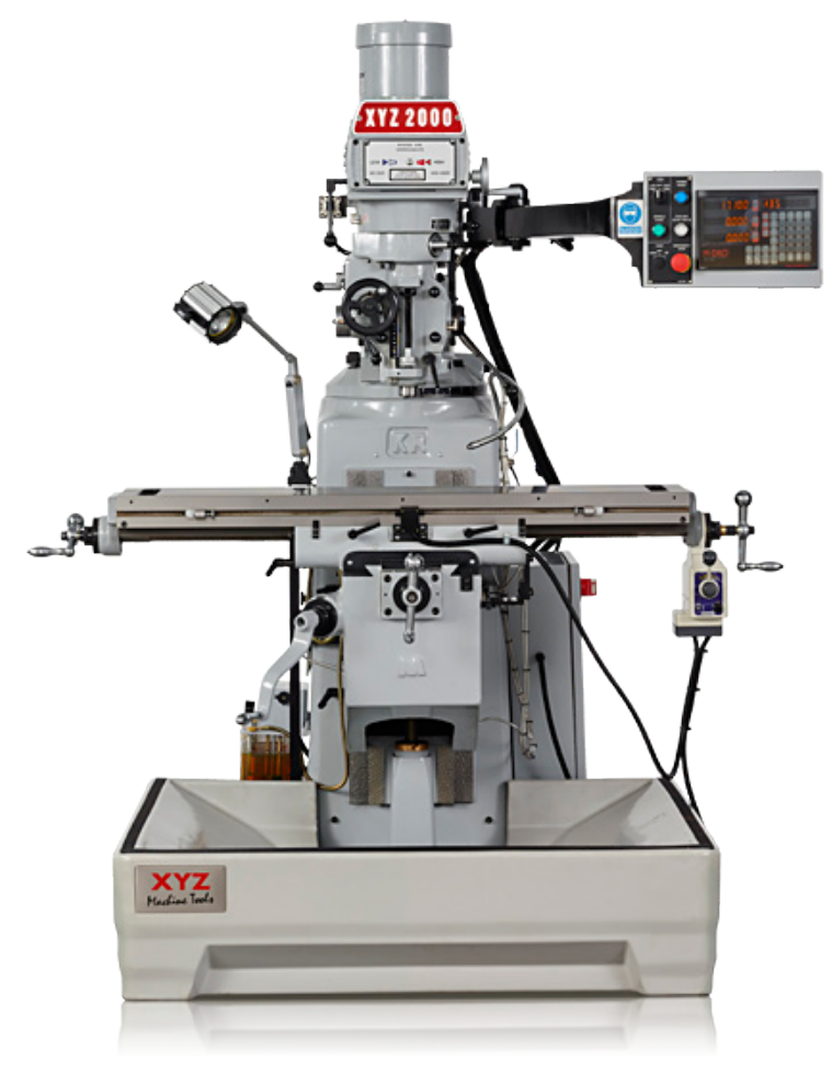
Guards removed for clarity

All XYZ manual machines are built of solid ribbed cast iron to provide unrivalled rigidity and stability and all are fitted with European bearings and electrical components to full CE approval.