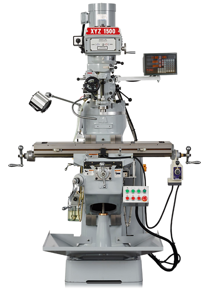
Guards removed for clarity

All XYZ manual machines are built of solid ribbed cast iron to provide unrivalled rigidity and stability and all are fitted with European bearings and electrical components to full CE approval.